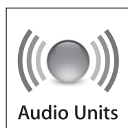
Audio Units logo Grayscale