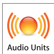
Audio Units logo Four-color